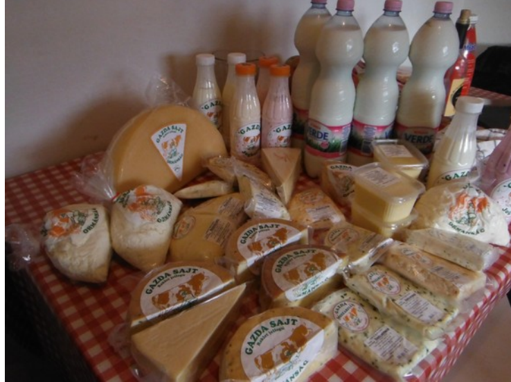
cheese and milk from a local small factory

Fenntartható Ormánság Nonprofit Kft. Sustainable Ormánság Nonprofit Ltd. http://evskemes.wordpress.com / www.ormansag-zlatnadolina.org E-mail: ormansagzoldut@gmail.com Hungary, 7843-Kémes, Petőfi u. 18-20 Tel: +36-30-281-3869 or +36-70-427-39-23